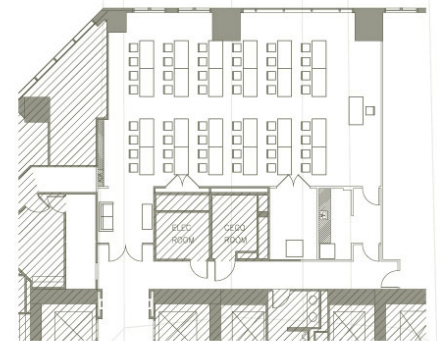
TRAINING SEATING 48 Seats

TO RESERVE THE BUILDING CONFERENCE CENTER Contact the Building Concierge at 312.692.8140