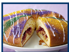
Nut-filled King's Cake

Surprise your office with a Mardi Gras treat, and offer good fortune with a King's Cake! It also is great for parties, and guests of all ages!